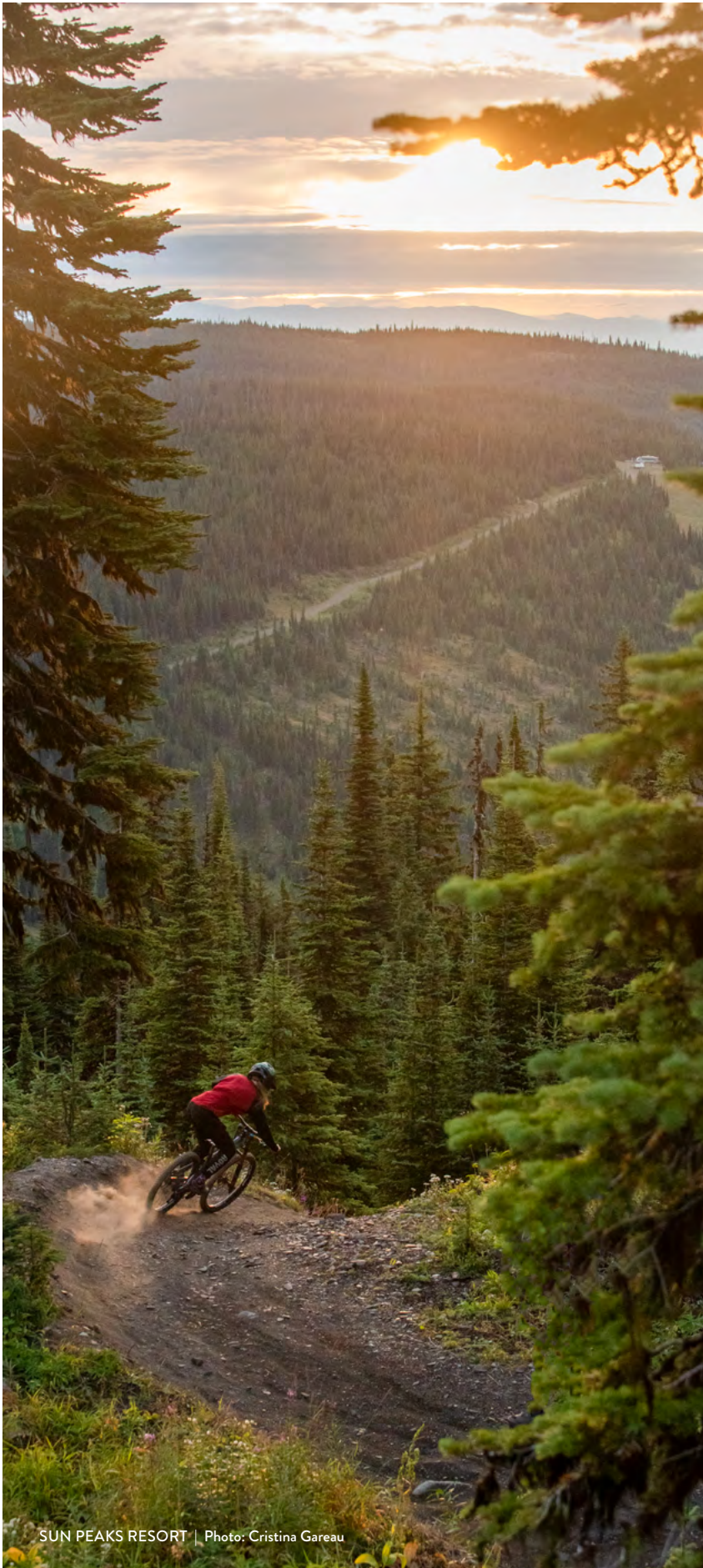
SUN PEAKS RESORT