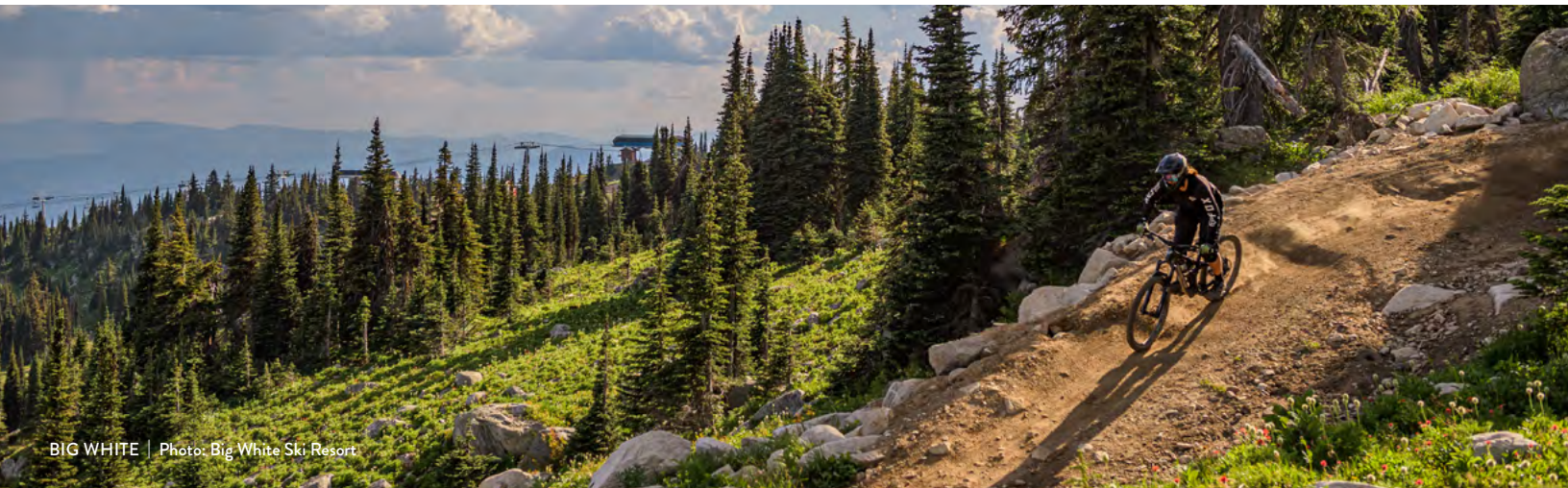
BIG WHITE

In addition to providing value to each organization, the project has successfully attracted more mountain bikers to the area, facilitated crossover tourism visits between resorts, and helped to boost the local economy.