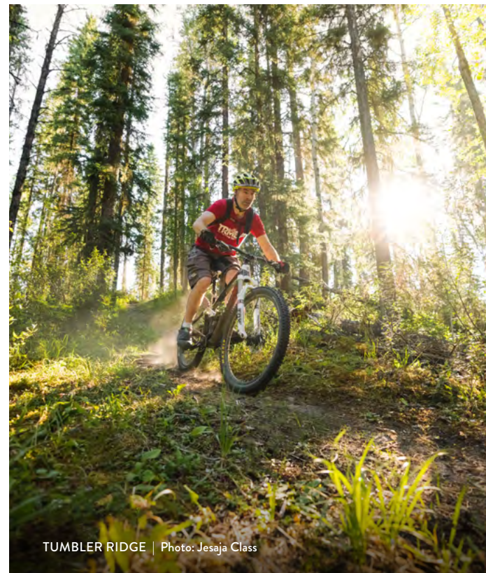
TUMBLER RIDGE