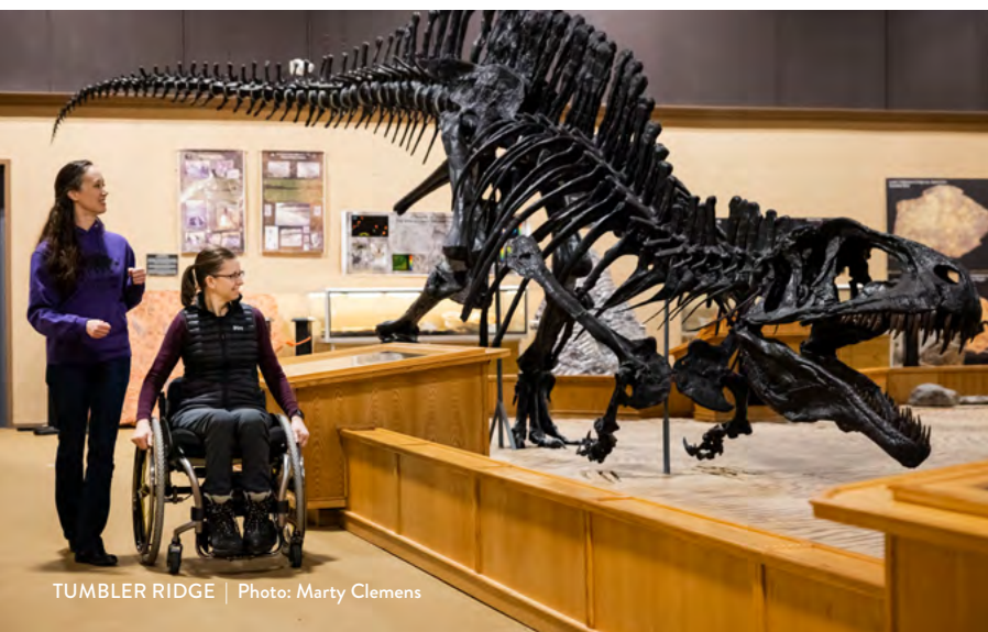
TUMBLER RIDGE | Photo: Marty Clemens

By expanding Tumbler Ridge's tourism infrastructure, along with its tourism and scientific programs, the Tumbler Ridge Global Geopark boosts visitation year-round, in turn supporting economic development and increasing employment in the area.